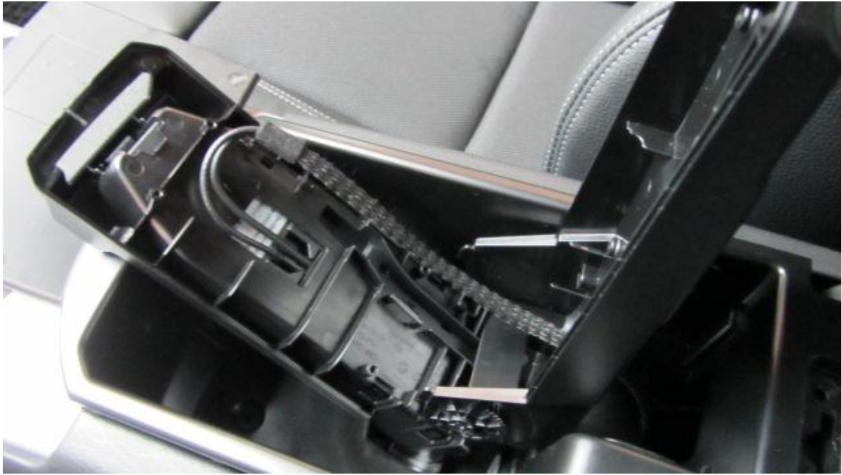
7th Handy storage disassemble (Fig. 5)