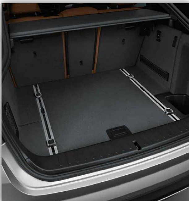
Standard hard cover above trunk space.