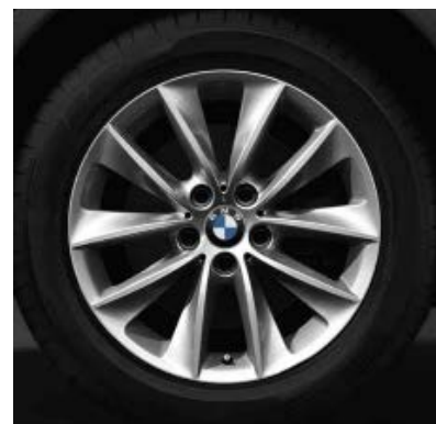
Standard base trim wheel style 307.