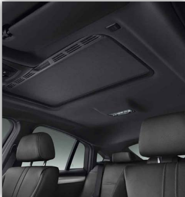
Rear centre light with reading lamps.