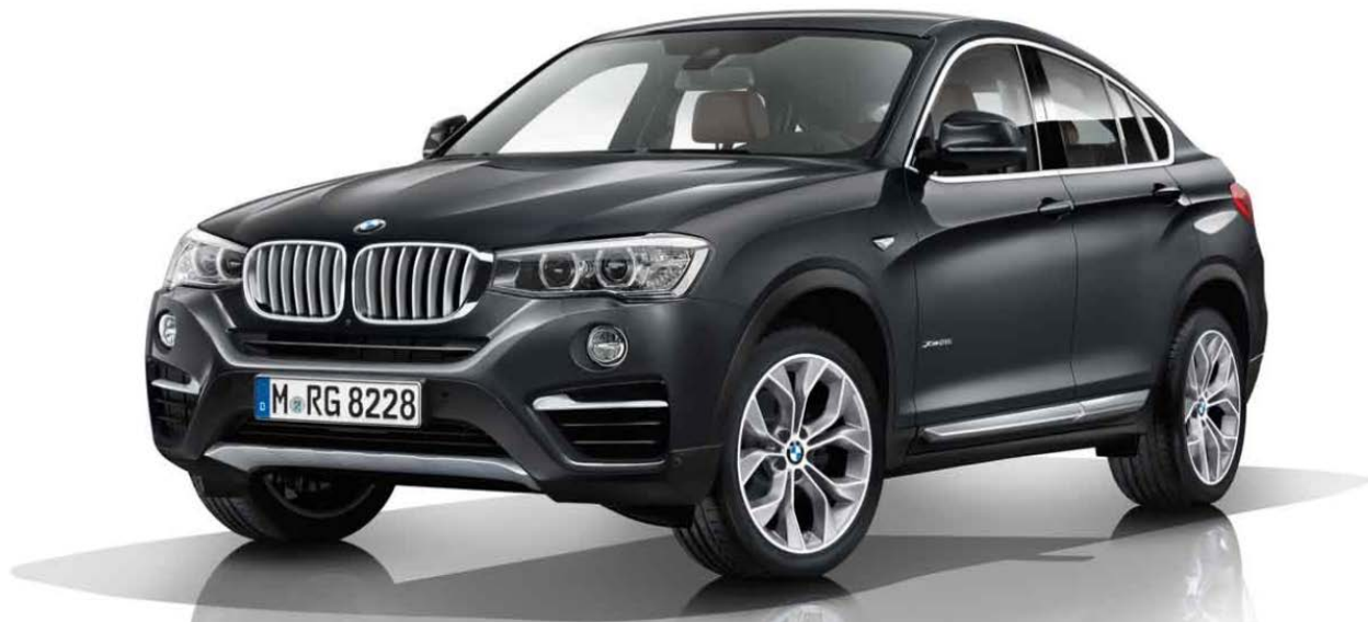
A90 – Dark Graphite Metallic in xLine trim.