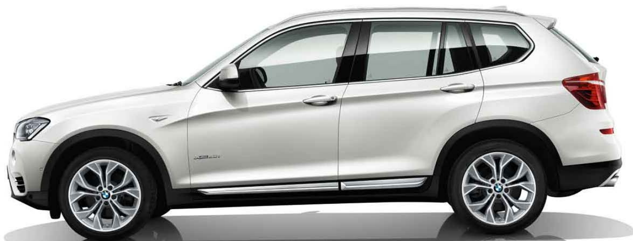
MY2015 X3 35i side profile comparison. xLine trim.