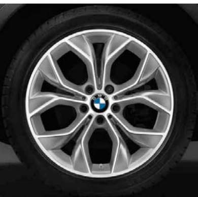
Standard xLine wheel style 608. Only available with A/S tires.