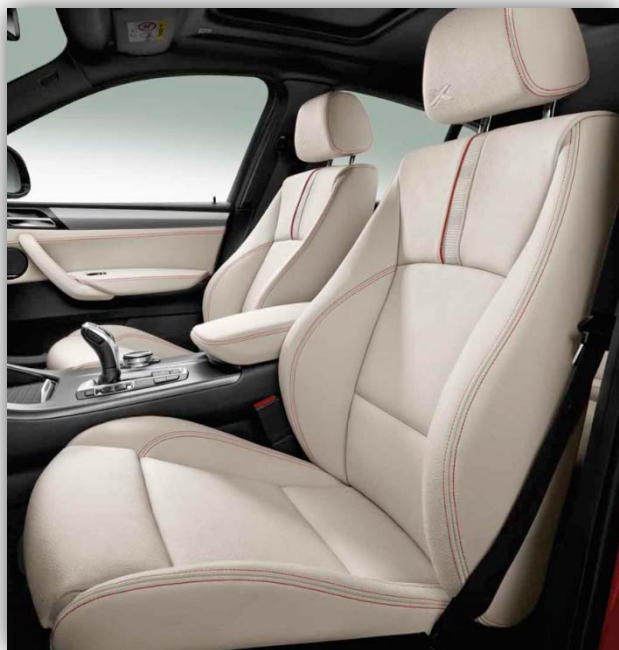
20mm lower seating position.

The new X4 upholstery and trim program is identical to the new 2015 X3. However, there are some minor interior design changes to be aware of: