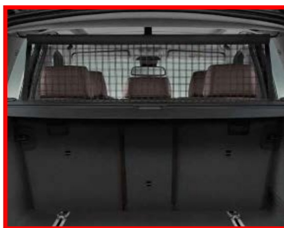
Not available on X4: Luggage compartment separating net.