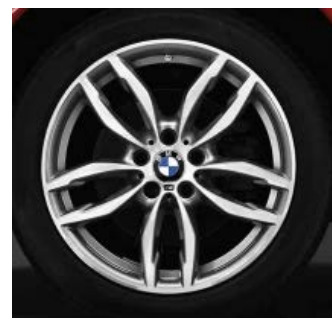
Standard X4 28i 19" M Sport Line wheel, style 622M. A/S standard, performance tire optional.