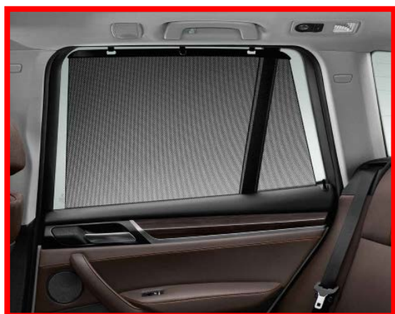
Not available on X4: Roller Sunblinds Rear Windows.