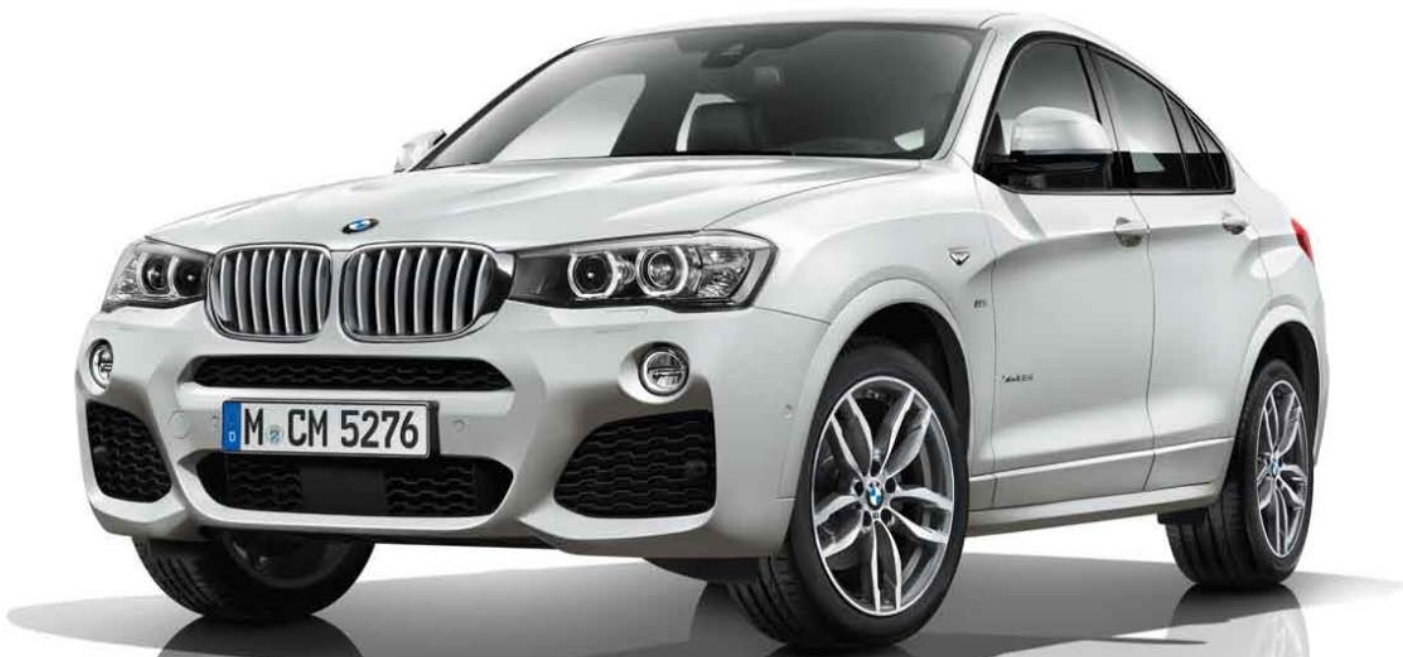
BMW X4 28i with M Sport Line in Alpine White. Standard 28i M Sport wheel – 19" A/S style 622M.