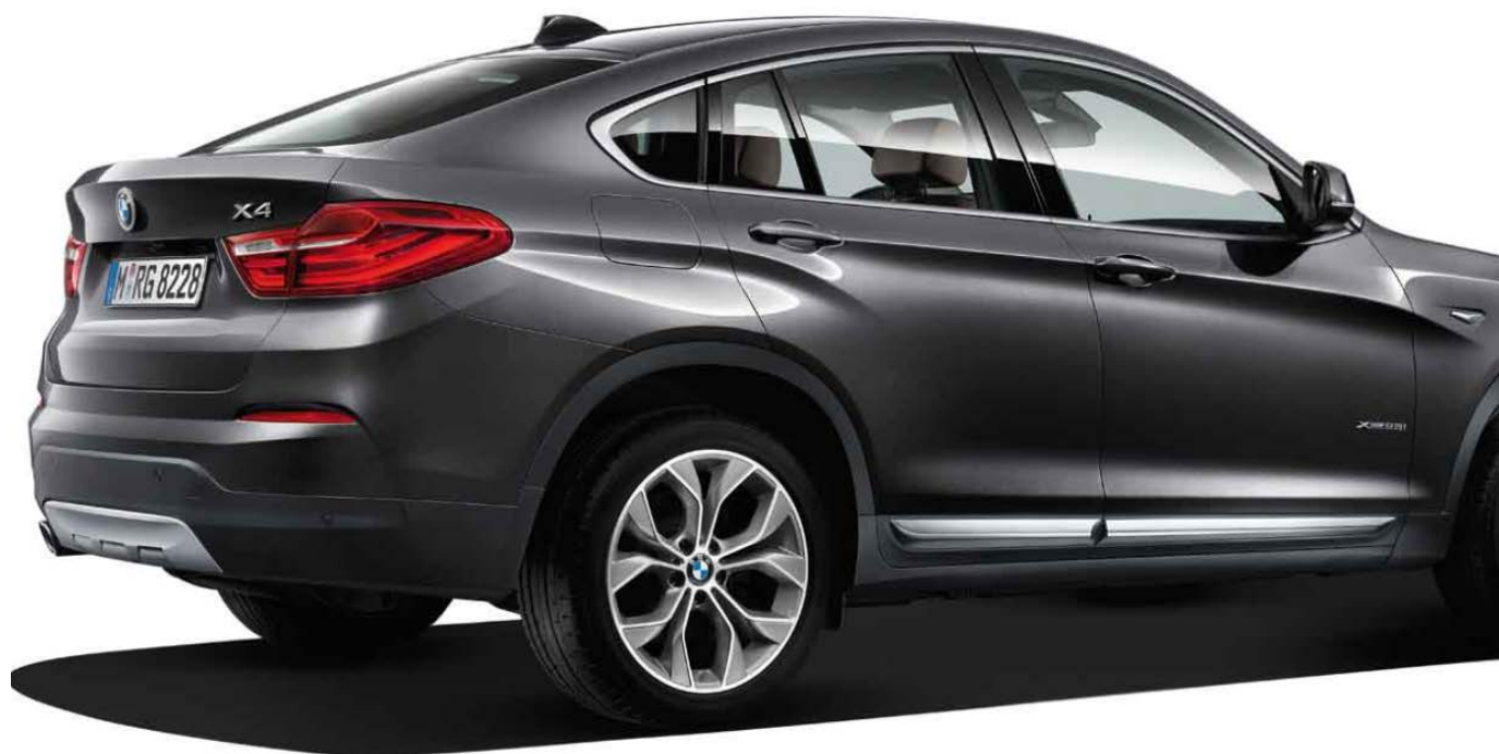
BMW X4 28i with xLine in Dark Graphite Metallic. Standard xLine wheel – 19" A/S style 608.