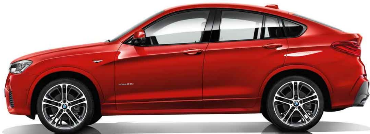
MY2015 X4 35i side profile comparison. Standard M Sport Line with standard 20" wheels (2VX)