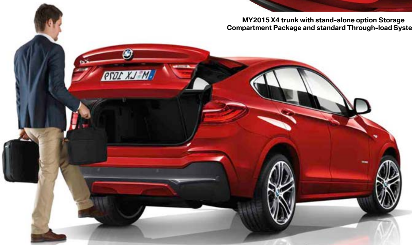
MY2015 X4 Smart Opener function for hands-free open and close of tailgate. With 322 Comfort Access in Premium Package.