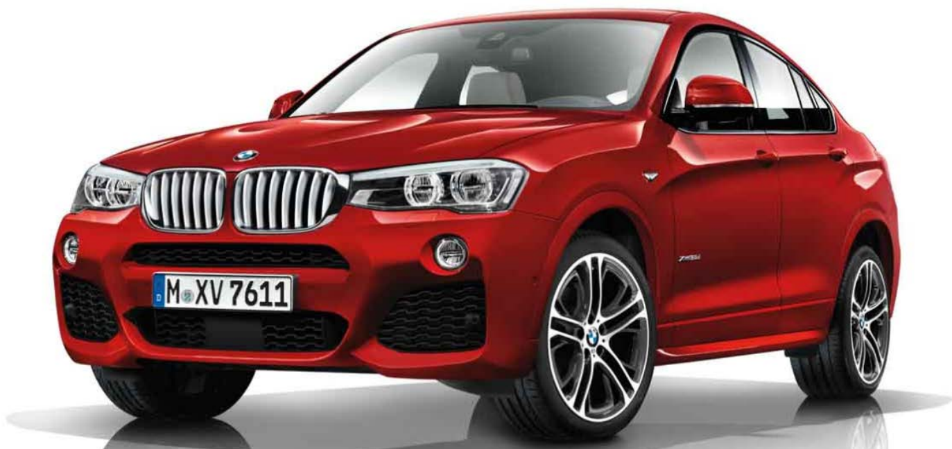
BMW X4 35i with standard M Sport Line (35i only) in Melbourne Red Metallic.