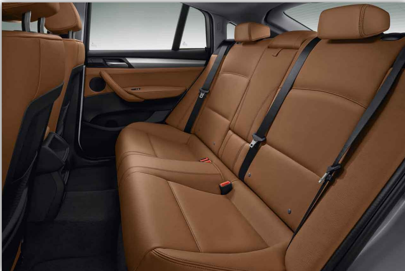
2 + 1 rear bench configuration vs. conventional 3 person bench in 2015 X3 (shown: Saddle Brown Nevada Leather).