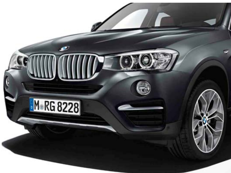
BMW X4 28i in xLine Trim. Standard bi-xenon headlights with LED fog lights shown.