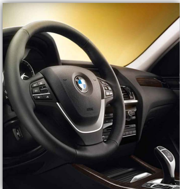
Standard paddle shifters and sport gear selector.