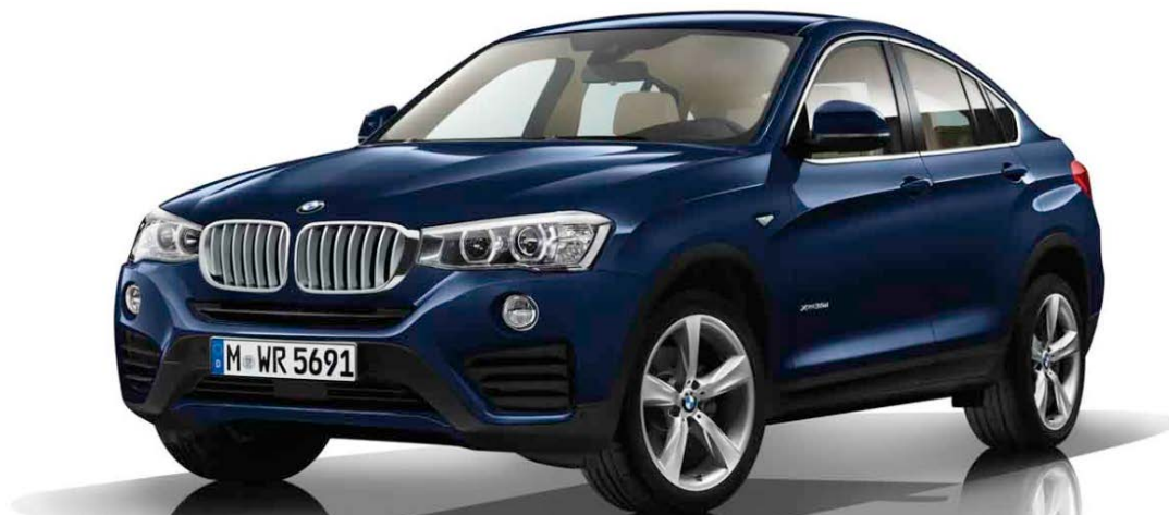
X4 28i in base trim, Deep Sea Blue Metallic. Note: wheel shown not available.