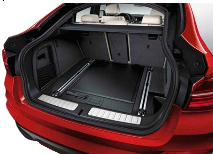
MY2015 X4 trunk with stand-alone option Storage Compartment Package and standard Through-load System.