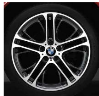
Standard X4 35i wheel 20" alloy style 310M, performance tires only. Optional on 28i with M Sport.